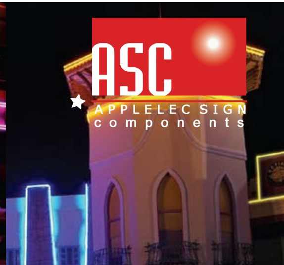
* Puente El Velero, Guayaquil, Ecuador .